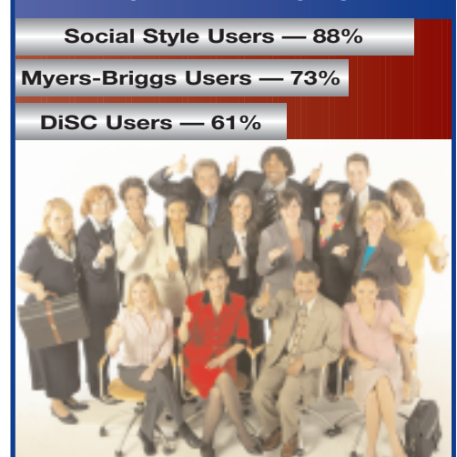
FIGURE 1: PERCEPTION OF HOW WELL IET WORKS

Almost nine in 10 professionals (86%) used one of the leading third-party IET models: Social Style, DiSC or Myers-Briggs. These professionals identified