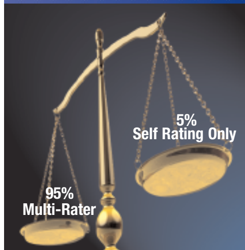
FIGURE 4: VALUE OF MULTI-RATER FEEDBACK VS. SELF RATING ONLY

When asked about ideal length for IET, most training professionals chose a half-day (37%) or full-day (24%) class. The largest companies (over 23,000 employees) were most likely to provide full-day IET classes (36%).